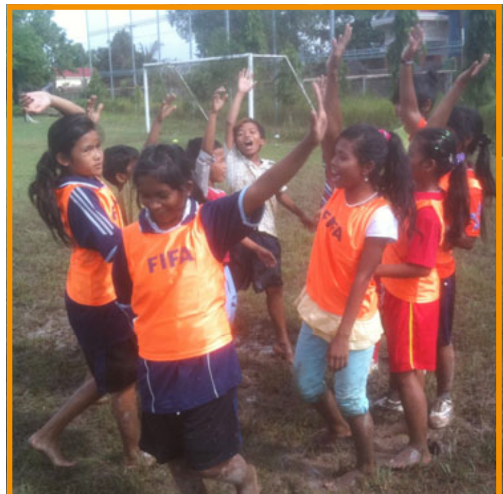
Having some fun at Sihanoukville